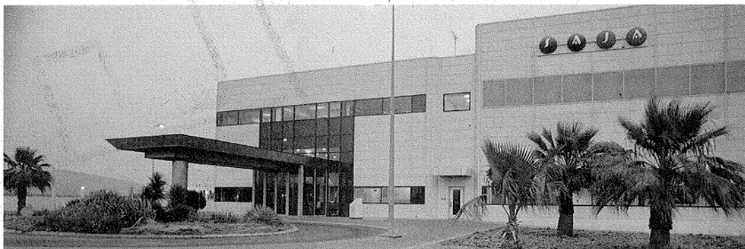
SAJA factory in Jeddah