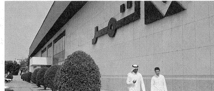
One of the Group branches in KSA

ternational companies will execute the project. The new distribution center will start operations end 2009. This will enhance further Tamer distribution network across the region and provide comprehensive value added supply chain services to our customers, he added.